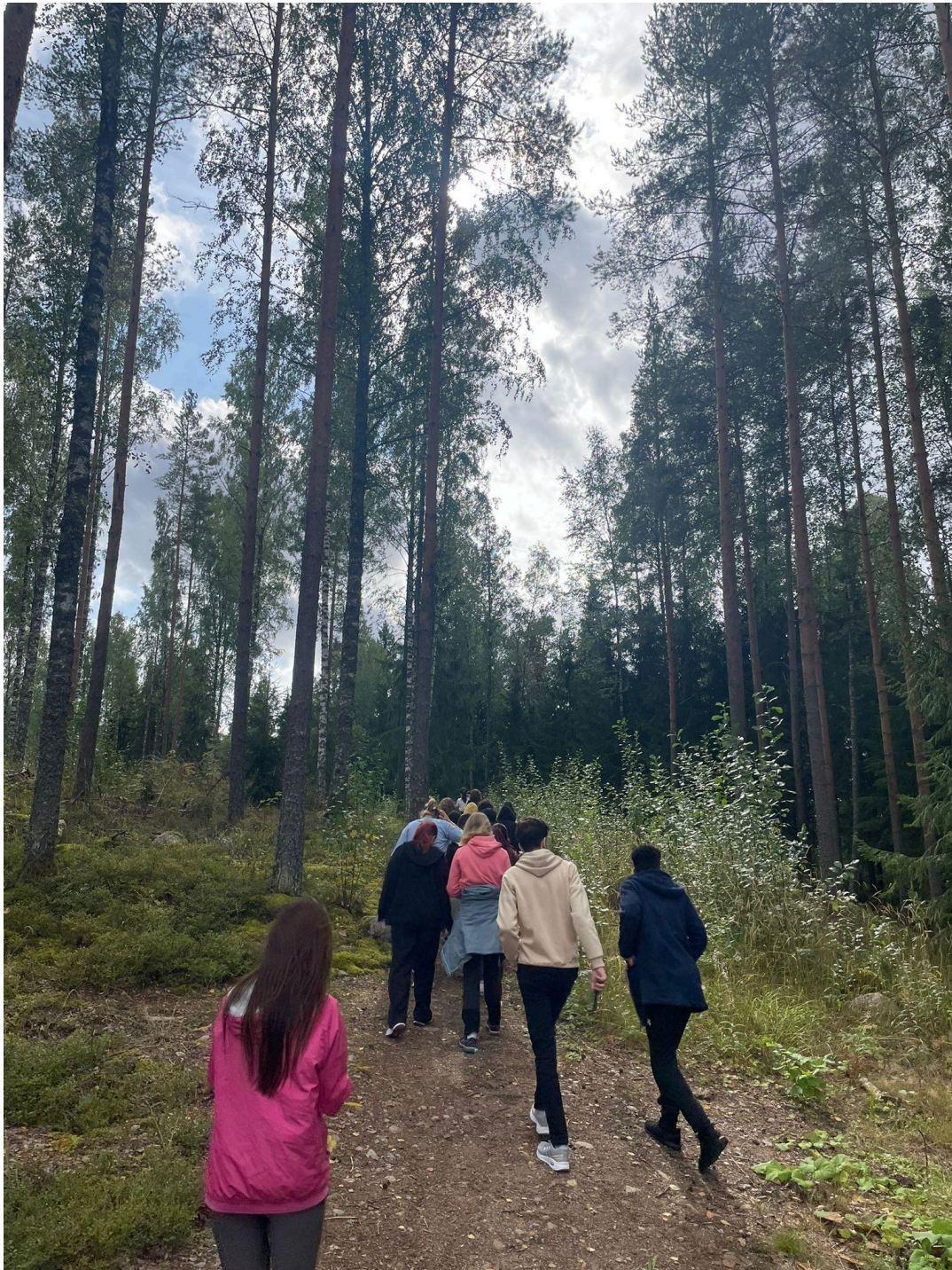
Volunteers on a nature walk.

Finally, did you know that It's been estimated that there are over three million saunas in Finland! So, if you are curious about relaxing in a room heated with the sauna stoves, Finland offers plenty of opportunities for that!