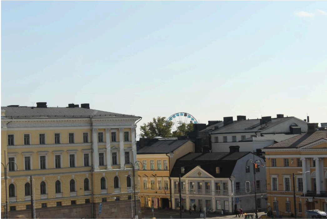
Helsinki city center view nearby Maailmanvaihto's office.

Our office is located at the address Oikokatu 3 in Helsinki, just a 10-minute walk from the Central Railway Station. Please, feel free to reach out if you have questions or feedback! Office Hours: Mon–Fri, 10 a.m. to 4 p.m.