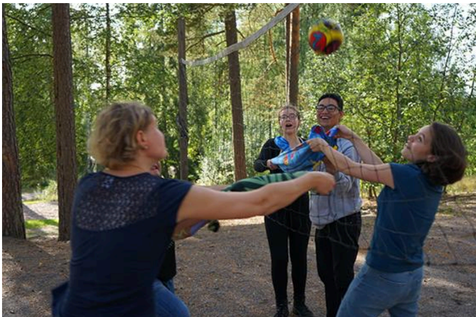
On-arrival training camp activities.

Maailmanvaihto is led by a board of 10–12 volunteers, mostly in their 20s and 30s, many of whom have participated in exchange programs themselves. They work alongside our staff to keep things running smoothly. In 2025, our board will be chaired by Hanna Sainio.