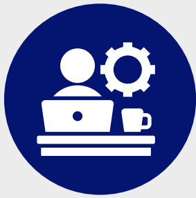
Administration and Communication