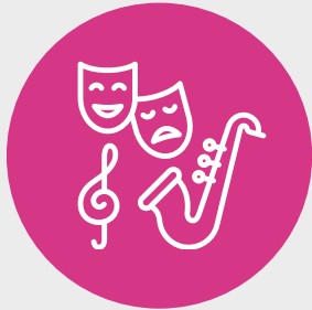
Art and Culture