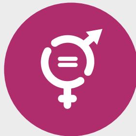
Gender and Human Rights