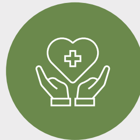
Health and Well- being