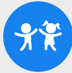
Childhood / Education